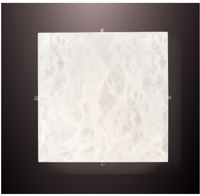
Pictured in satin brass with daylight 5000K bulb